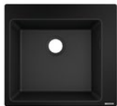
Built-in sink 450 S510-F450 # 43312, -170, -290, -380

Required accessories: D16-10 # 43927, -000 Manual waste and overflow set D16-11 # 43937, -000 Automatic waste and overflow set