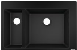
Built-in sink 180 x 450 S510-F635 # 43315, -170, -290, -380

Required accessories: D16-10 # 43927, -000 Manual waste and overflow set D16-11 # 43937, -000 Automatic waste and overflow set