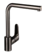
Decor Brushed Black Chrome Single lever kitchen mixer with swivel spout # 31817343