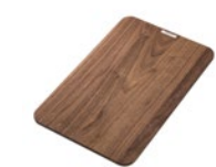
F15 Cutting board Walnut # 40960000