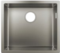
Undermount sink 500 S719-U500 # 43427, -800

Required accessories: D14-10 # 43921, -800 Manual waste set D14-11 # 43931, -800 Automatic waste set