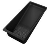
F14 Multifunctional strainer Matt Black # 40963000