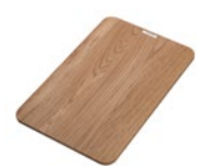
F16 Cutting board Oak # 40961000