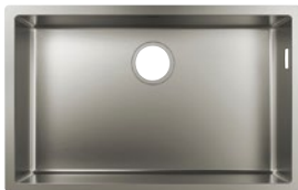
Undermount sink 660 S179-U660 # 43428, -800

Required accessories: D14-10 # 43921, -800 Manual waste set D14-11 # 43931, - 800 Automatic waste set