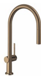
Talis M54 Brushed Bronze Single lever kitchen mixer 210, pull-out spout, 1jet # 72802143