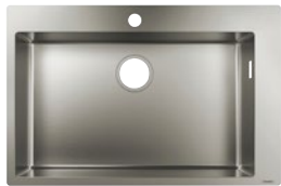
Built-in sink 660 S711-F660 # 43302, -800 with 1 tap hole S712-F660 # 43308, -800 with 2 tap holes

Required accessories: D14-10 # 43921, -800 Manual waste set D14-11 # 43931, - 800 Automatic waste set