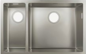
Undermount sink 180 x 450 S719-U655 # 43429, -800

Required accessories: D14-10 # 43921, -800 Manual waste set D14-11 # 43931, - 800 Automatic waste set