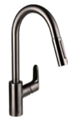
Decor Brushed Black Chrome Single lever kitchen mixer with pull-out spray # 31815343