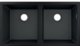
Undermount sink 370 x 370 S510-U770 # 43434, -170, -290, -380

Required accessories: D17-10 # 43928, -000 Manual waste and overflow set D17-11 # 43938, -000 Automatic waste and overflow set