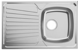
Built-in sink S210-F340 # 43350, -800 Includes manual waste set