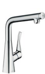
Metris Select Single lever kitchen mixer 320 # 14883003