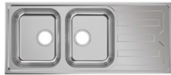
Built-in sink S310-F710 # 43352, -800 Includes manual waste set