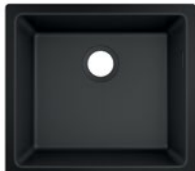
Undermount sink 450 S510-U450 # 43431, -170, -290, -380

Required accessories: D16-10 # 43927, -000 Manual waste and overflow set D16-11 # 43937, -000 Automatic waste and overflow set