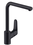
Decor Matt Black Single lever kitchen mixer with swivel spout # 31817673