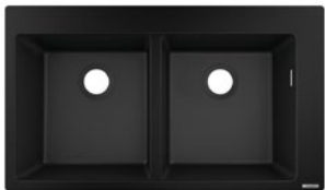
Built-in sink 370 x 370 S510-F770 # 43316, -170, -290, -380

Required accessories: D17-10 # 43928, -000 Manual waste and overflow set D17-11 # 43938, -000 Automatic waste and overflow set