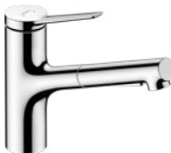
Zesis Single lever kitchen mixer 150, pull out spray, 2 jet # 74800003