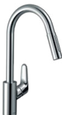
Decor Single lever kitchen mixer with pull-out spray # 31815223