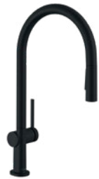
Talis M54 Matt Black Single lever kitchen mixer 210, pull-out spray, 2jet # 72800673