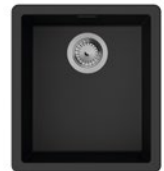
Built-in sink S520-F350 # 43349, -170, -290, -380 Includes manual waste set

Required accessories: D17-10 # 43928, -000 Manual waste and overflow set D17-11 # 43938, -000 Automatic waste and overflow set