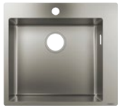
Built-in sink 450 S711-F450 # 43301, -800 with 1 tap hole S712-F450 # 43305, -800 with 2 tap holes

Required accessories: D14-10 # 43921, -800 Manual waste set D14-11 # 43931, - 800 Automatic waste set