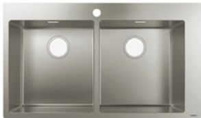
Built-in sink 370 x 370 S711-F765 # 43303, -800 with 1 tap hole S712-F765 # 43311, -800 with 2 tap holes

Required accessories: D15-10 # 43922, -800 Manual waste set D15-11 # 43932, - 800 Automatic waste set