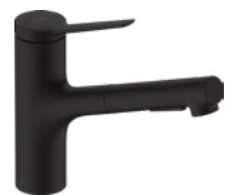
Zesis Matt Black Single lever kitchen mixer 150, pull-out spray, 2 jet # 74800673