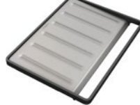
F17 Mobile drainboard Stainless steel # 40962800