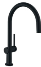
Talis M54 Matt Black Single lever kitchen mixer 220, 1jet # 72804673