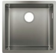
Undermount sink 400 S719-U400 # 43425, -800

Required accessories: D15-10 # 43922, -000 Manual waste set D15-11 # 43932, - 000 Automatic waste set