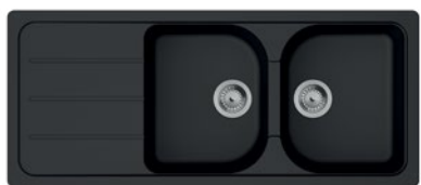
Built-in sink S520-F735 # 43348, -170, -290, -380 Includes automatic waste set