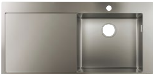
Built-in sink 450 with drainboard S715-F450 # 43306, -800 with 1 tap hole S717-F450 # 43307, -800 with 2 tap holes

Required accessories: D14-10 # 43921, -800 Manual waste set D14-11 # 43931, - 800 Automatic waste set