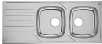
Built-in sink S210-F720 # 43351, -800 Includes manual waste set