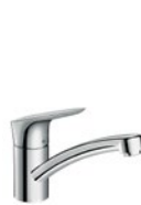
Logis Single lever kitchen mixer 120 # 71830003