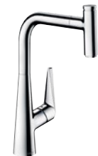
Talis Select Single lever kitchen mixer 300 with pull-out spout # 72821003