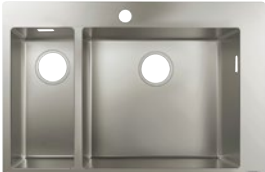
Built-in sink 180 x 450 S711-F655 # 43309, -800 with 1 tap hole S712-F655 # 43310, -800 with 2 tap holes

Required accessories: D14-10 # 43921, -800 Manual waste set D14-11 # 43931, - 800 Automatic waste set