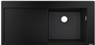
Built-in sink 450 with drainboard S514-F450 # 43314, -170, -290, -380

Required accessories: D16-10 # 43927, -000 Manual waste and overflow set D16-11 # 43937, -000 Automatic waste and overflow set