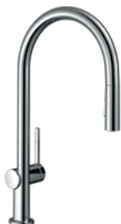
Talis M54 Single lever kitchen mixer 210, pull-out spray, 2jet # 72800003