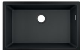
Undermount sink 660 S510-U660 # 43432, -170, -290, -380

Required accessories: D16-10 # 43927, -000 Manual waste and overflow set D16-11 # 43937, -000 Automatic waste and overflow set