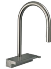
Aquino Select Stainless Steel Optic Single lever kitchen mixer 170, pull-out spout, 3 jet, sBox # 73831803