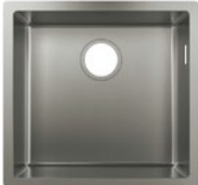
Undermount sink 450 S719-U450 # 43426, -800

Required accessories: D14-10 # 43921, -800 Manual waste set D14-11 # 43931, -800 Automatic waste set