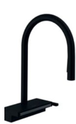
Aquino Select Matt Black Single lever kitchen mixer 170, pull-out spout, 3 jet, sBox # 73831673