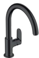
Vernis Matt Black Single lever kitchen mixer 210 with swivel spout # 71870673