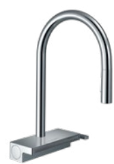
Aquino Select Single lever kitchen mixer 170, pull-out spout, 3 jet, sBox # 73831003