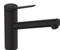
Zesis Matt Black Single lever kitchen mixer 150, 1 jet # 74802673