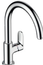
Vernis Single lever kitchen mixer 210 with swivel spout # 71870003