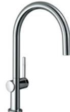
Talis M54 Single lever kitchen mixer 220, 1jet # 72804003