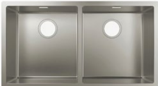
Undermount sink 370 x 370 S719-U765 # 43430, -800

Required accessories: D15-10 # 43922, -800 Manual waste set D15-11 # 43932, - 800 Automatic waste set