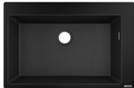
Built-in sink 660 S510-F660 # 43313, -170, -290, -380

Required accessories: D16-10 # 43927, -000 Manual waste and overflow set D16-11 # 43937, -000 Automatic waste and overflow set