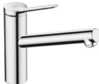
Zesis Single lever kitchen mixer 150, 1 jet # 74802003