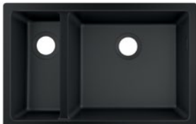
Undermount sink 180 x 450 S510-U635 # 43433, -170, -290, -380

Required accessories: D16-10 # 43927, -000 Manual waste and overflow set D16-11 # 43937, -000 Automatic waste and overflow set