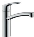
Decor Single lever kitchen mixer # 31806223