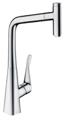
Metris Select Single lever kitchen mixer 320 with pull-out spout # 14884003