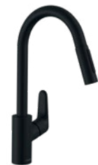
Decor Matt Black Single lever kitchen mixer with pull-out spray # 31815673