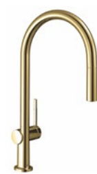
Talis M54 Polished Gold Optic Single lever kitchen mixer 210, pull-out spout, 1jet # 72802993