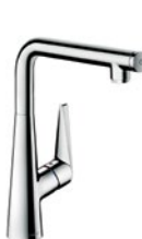
Talis Select Single lever kitchen mixer # 72820003