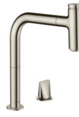
hansgrohe M7119H200 KitchenMixer_StainlessSteel

The ergonomic lever handle on the front right corner of the sink's rim makes it easy to operate the faucet. Turning the lever adjusts water temperature, while switching it regulates water volume.