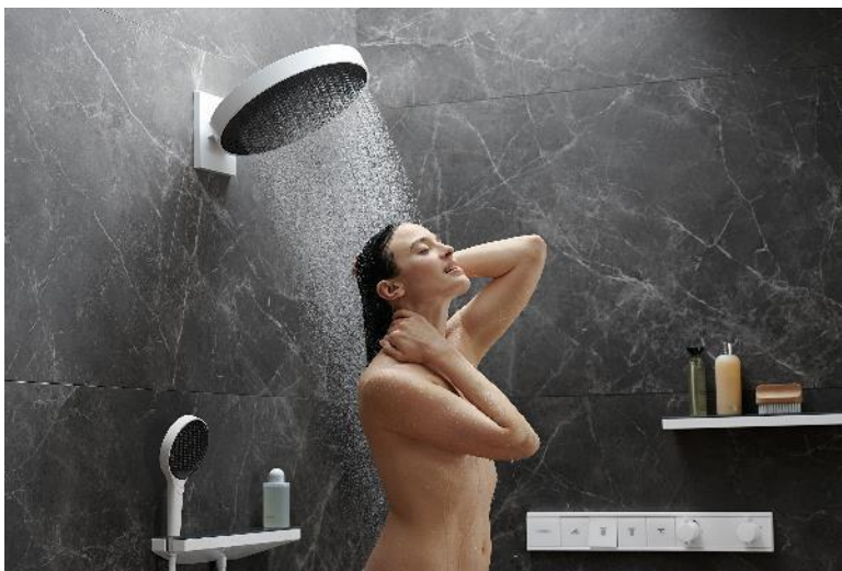
har00979.jpg hansgrohe delivers a truly extraordinary shower experience with Rainfinity.

hansgrohe is making a new statement in the bathroom with the Rainfinity shower range. Thanks to its overall composition of innovative technology, stylish design, and superior quality, Rainfinity opens up a new dimension of showering. With its concave shape and innovative wall connection, which makes the conventional shower arm superfluous, Rainfinity is nothing short of a trendsetter. The modern surface in elegant, matte white and the contemporary graphite of the simply structured jet disc are a visual highlight in the bathroom.