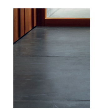
Wall material: Slatted teak

Wash basin: Custom made console from teak and marble