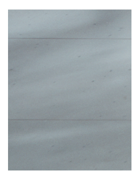
Floor material: Mutina Primavera white 120 x 40 cm

Carpet: Ceiling light: Urbanara / Nattica HK Living