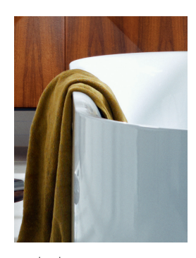
Bathtub Bette LuxOval Silhouette