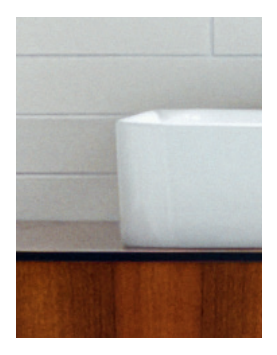
Wash bowl Bette Art