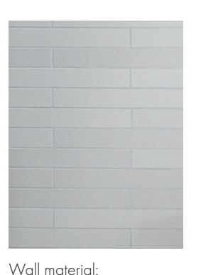
Mutina Mews Chalk 45 x 5 cm