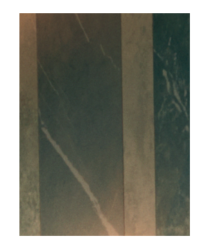
Wall material: Natural stone: Casalgrande Padana Marmoker (grafite, verde aver, brecchia carsica)