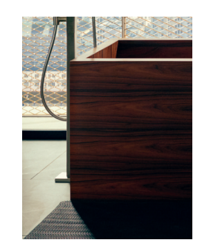
Bathtub: Custom made by Alegna, Material: Palisander