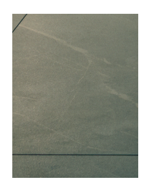
Floor material: Natural stone: Casalgrande Padana Marmoker (grafite)