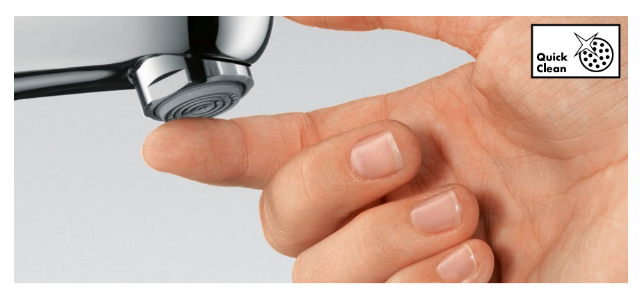
QuickClean makes it possible to simply wipe away lime scale deposits by rubbing a finger gently over the flexible silicone jets.