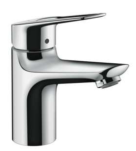
Novus Loop* 100 Single lever basin mixer #71085, -003 without waste set 5 Stars, 5 l/min