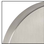
-821 Brushed Nickel